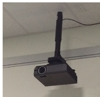
Ceiling Mounted Projector